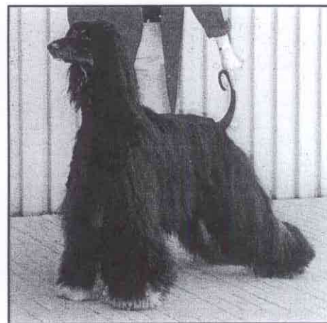
Int. Fin. S. Dk. Ch. Dur-i-Durran's Exciting Review