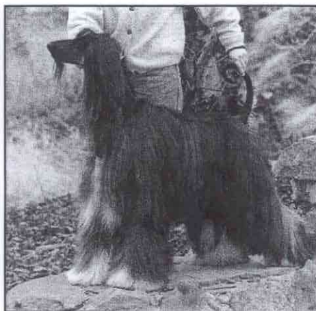
Int. Dk. Pl. Eps. Port. Ch. WW '92 Dur-i-Durran's Unique