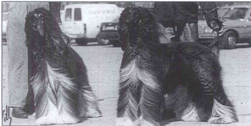
Dur-i-Durran's European Edition (right) with his father, Dur-i-Durran's Masquerade (left).