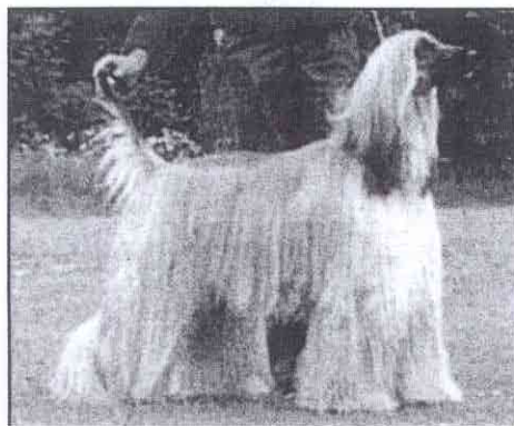
Int. Dk. Ch. Boxadan Complement