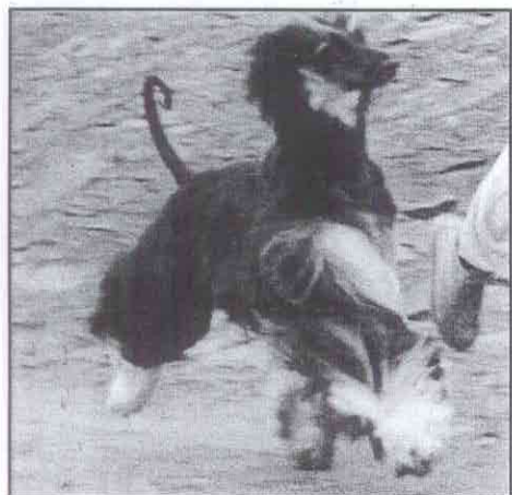
Int. Fr. Esp. Ch. Dur-i-Durran's Habanera