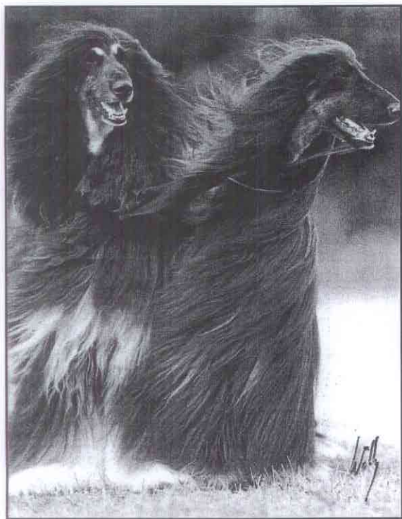
Int. Dk. Ch. Dur-i-Durran's Masquerade and Int. Dk. Ch. Dur-i-Durran's Gazebo