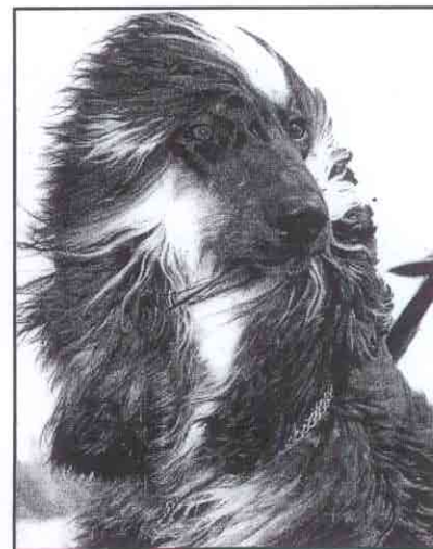
Dk. Pl. Ch. Dur-i-Durran's Fharakhaz